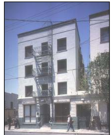
The Marshal House's roof and kitchen will be upgraded and a new elevator will be installed.

This grant marks the successful start of SRO's private fundraising efforts. The support of the Weingart Foundation, an organization that shares SRO's concern for the homeless and others in need, will ensure that housing for more than 800 residents is safe, decent and dignified.