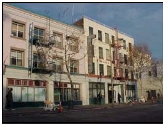
Improvements at the Harold and Panama hotels (above) and the LaJolla (below) will include repair and replacement of roofs, a new DVR security system and a buzzer intercom.